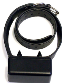
Rechargeable Receiver Collar