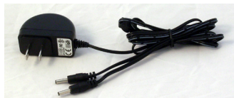
ET-1 Dual Charger

(The charger has two plugs, one to charge the collar and one to charge the transmitter.)