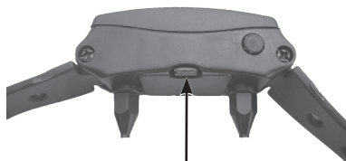
Engaged (tab is in)

Battery life is extended if you disengage the battery when it is not being used. To do this squeeze together the two finger tabs on each side of the battery pack and pull it out of the casing about 3/16 inch. Friction will retain the battery in the disengaged position as shown here.