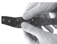
Press Battery Firmly Until Flush With Back