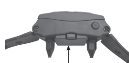
Insert Battery in Back of Collar