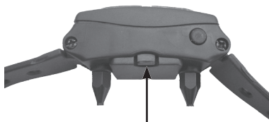
Disengaged (tab is out)

When the battery is disengaged, pressing the TEST button will produce no tone or status lights.